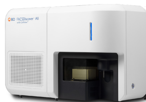
BD FACSDiscover™ A8 Cell Analyzer